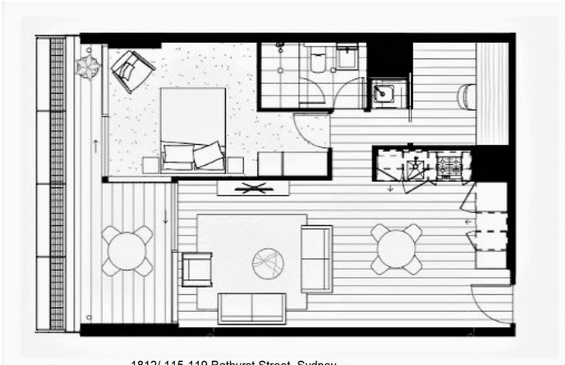
1812/ 115-119 Bathurst Street, Sydney

All of the information in this document has been provided by third parties who we believe are reliable and have given the information in good faith. However, we have not verified the information and cannot guarantee its accuracy. All interested persons should rely on their own enquiries and ensure that the information is suitable for their individual circumstances.